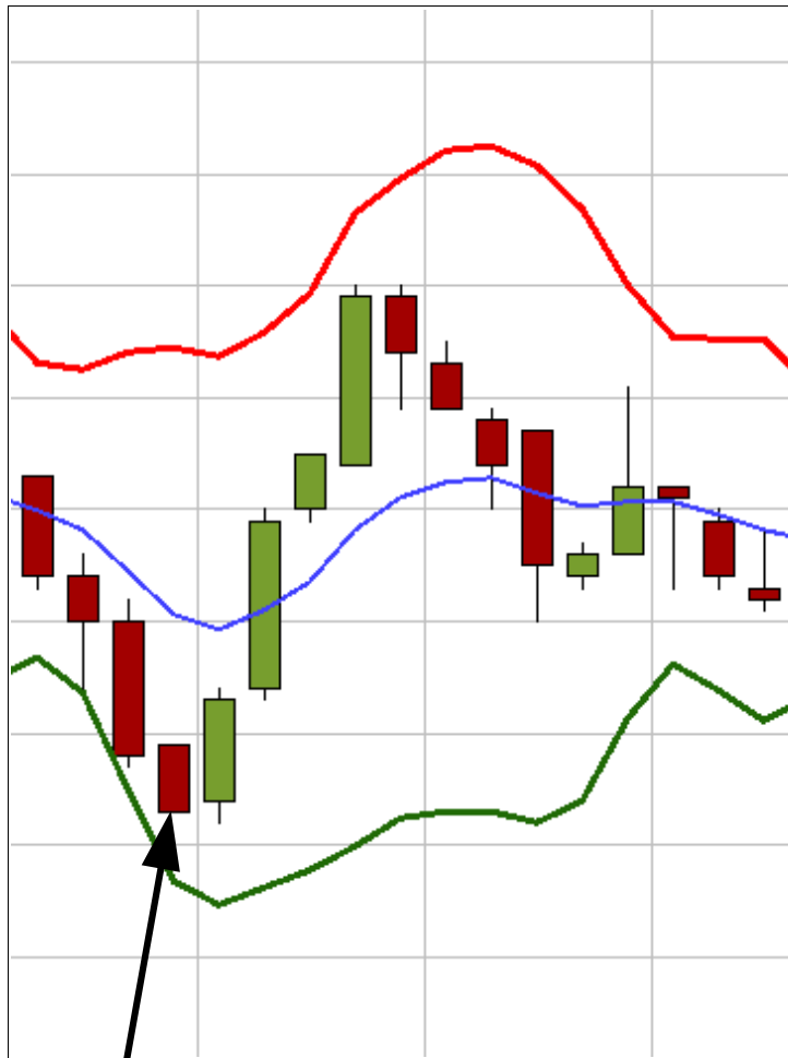
Higher Time Frame

Changing the time frame after the close of this candle.