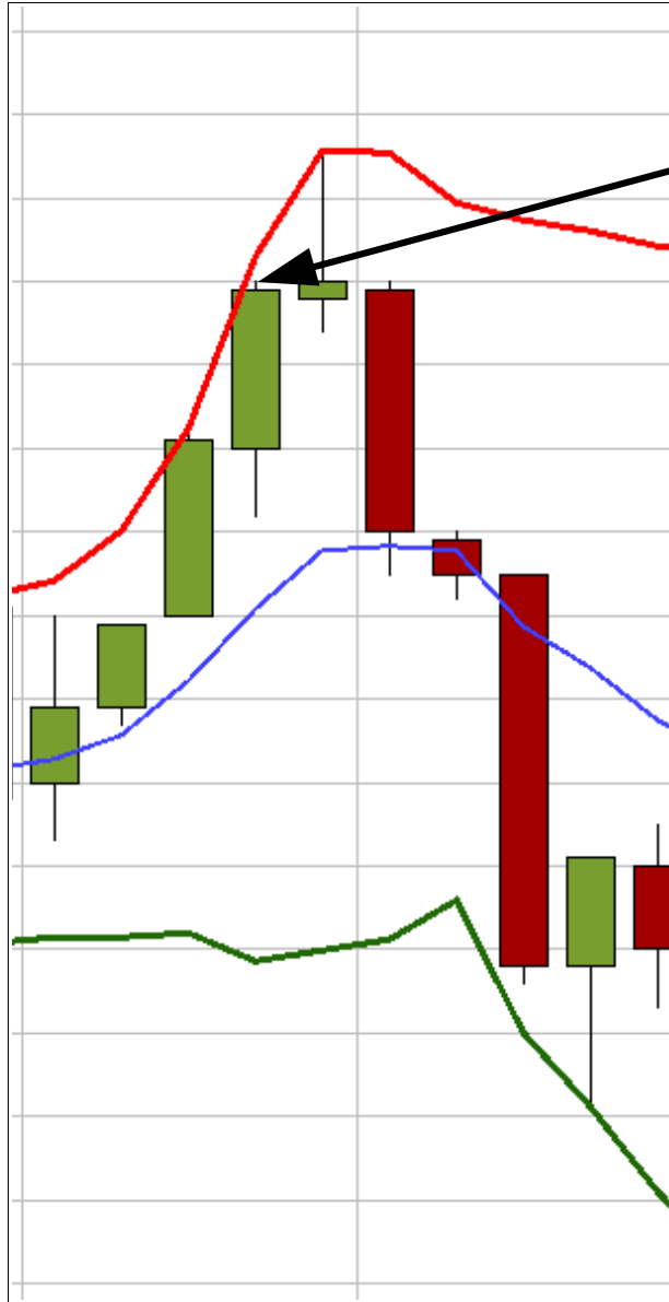
Higher Time Frame

Changing the time frame after the close of this candle.