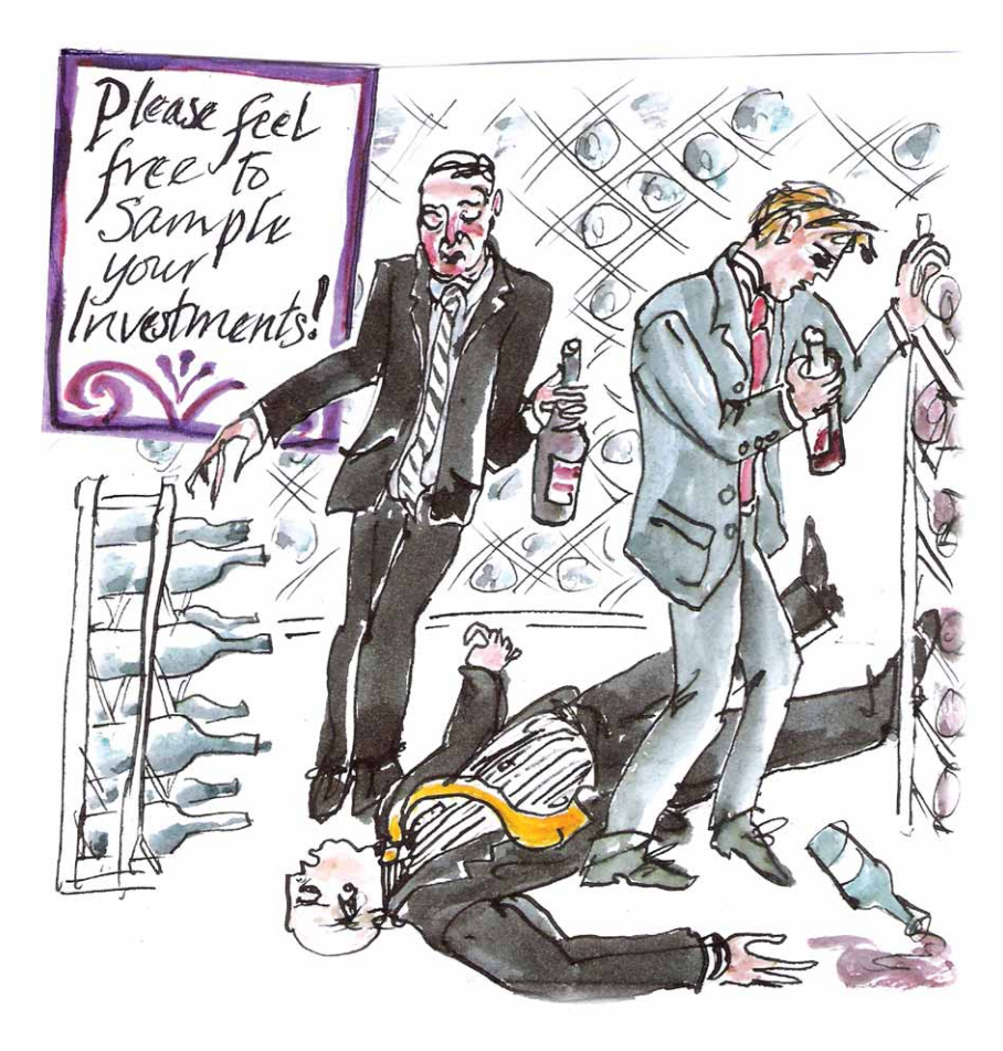
"Other risks of diversifying investments"

made is typical of the market. Some managers demand higher incentive fees, but if they are getting the returns, the client is probably going to want to pay them.